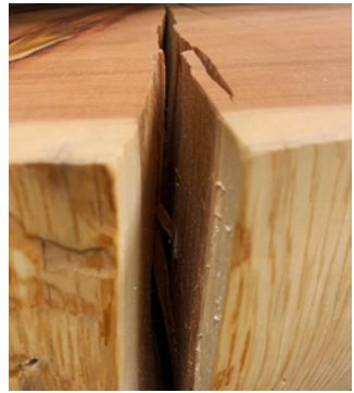
Checking in need of touch up.