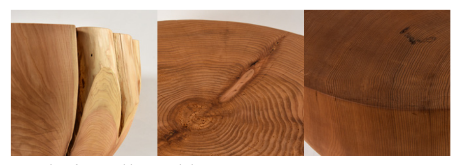
Examples of acceptable natural characteristics

Natural Material is subject to variation in color, grain, and natural chracteristics including mineral streaks, pitch pockets, and knots.