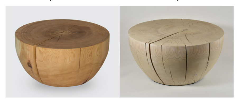
Acceptable range of profile variation on a DR-1L Drum

Each piece is hand carved from natural material and subject to variation from photos, illustrations, and floor samples. Dimensional tolerance varies by product but expected to fall within +/- 1/2" for solid wood pieces.