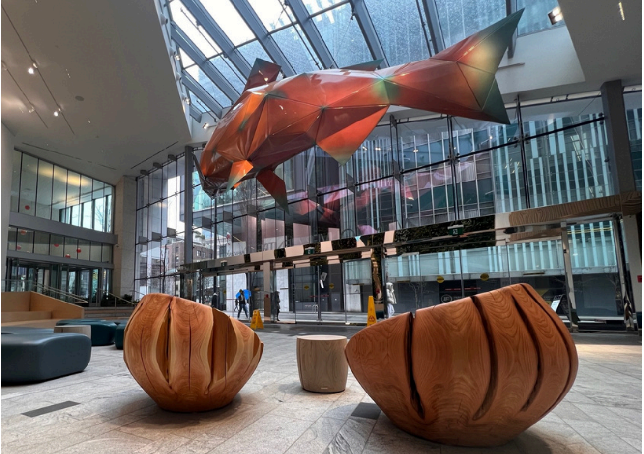
NEST , Spruce, White Hardwax Oil, Dimensions Shown 29.5" x 41" x 16.5"H, 30"H x 51" x 16.5"H